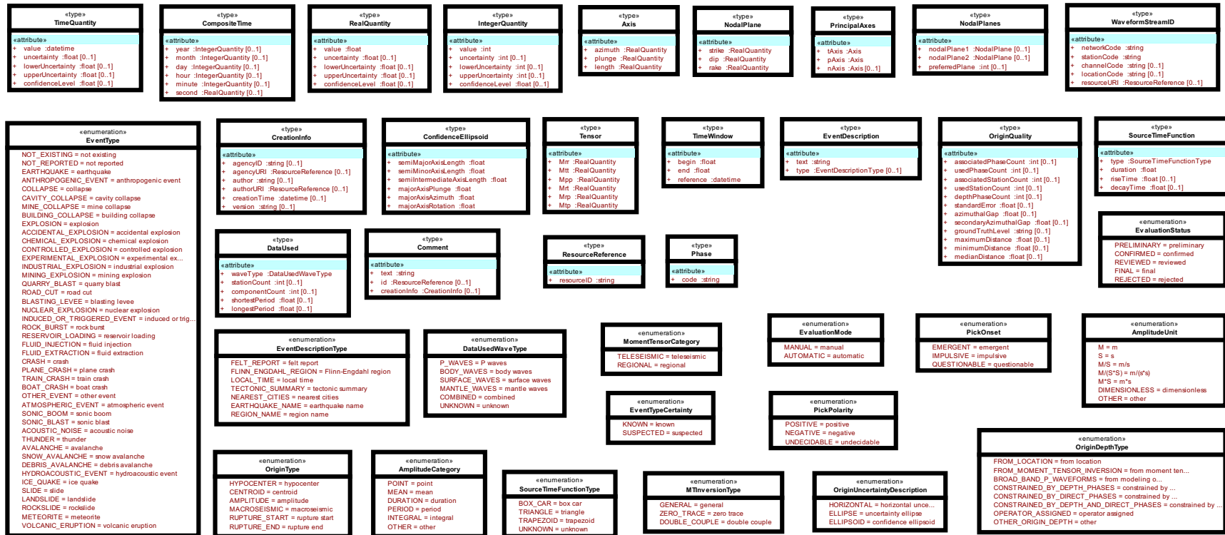
Figure 3: UML class diagram of types and enumerations used in the QuakeML BED class diagrams (Figs. 1 and 2).